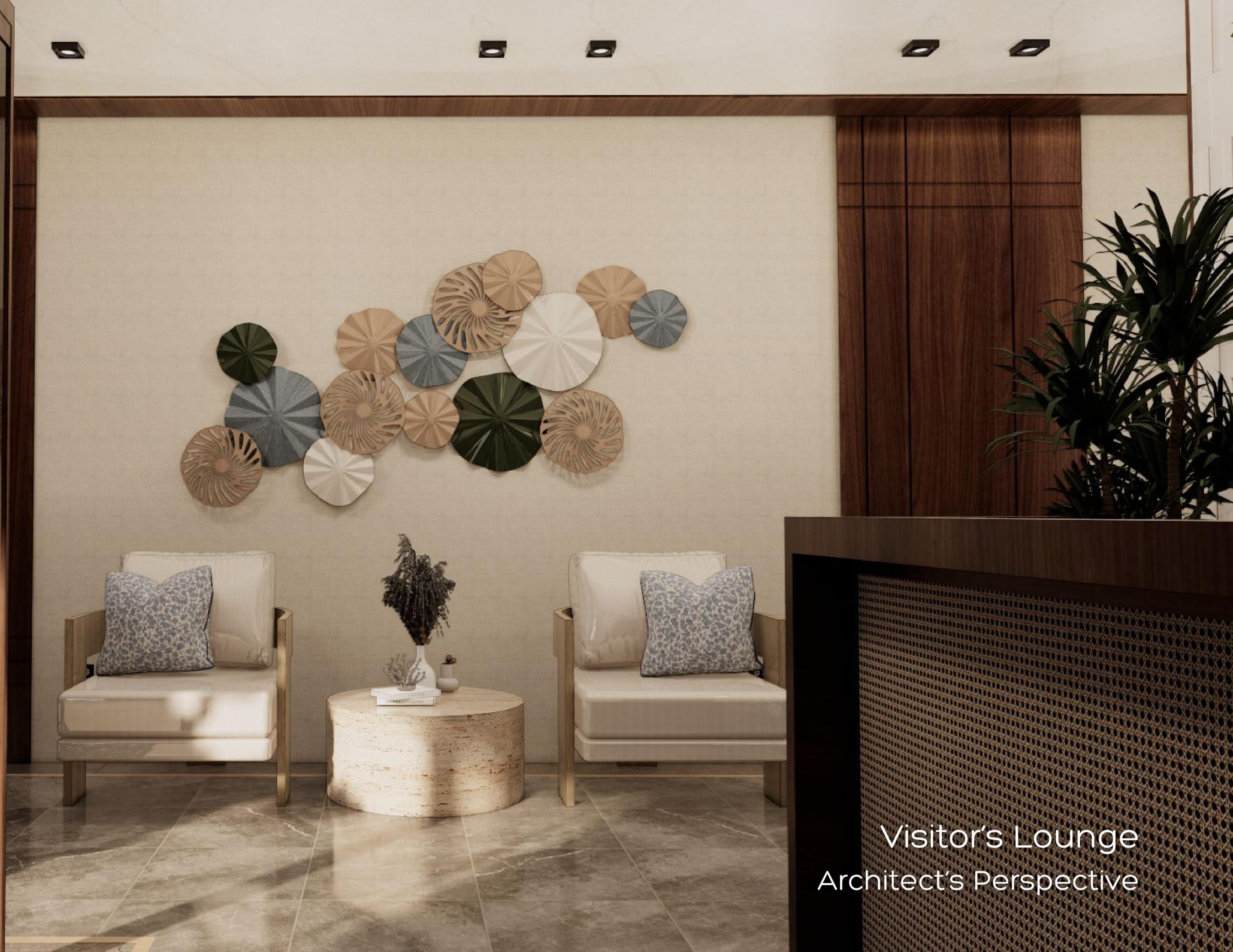
Visitor's Lounge Architect's Perspective