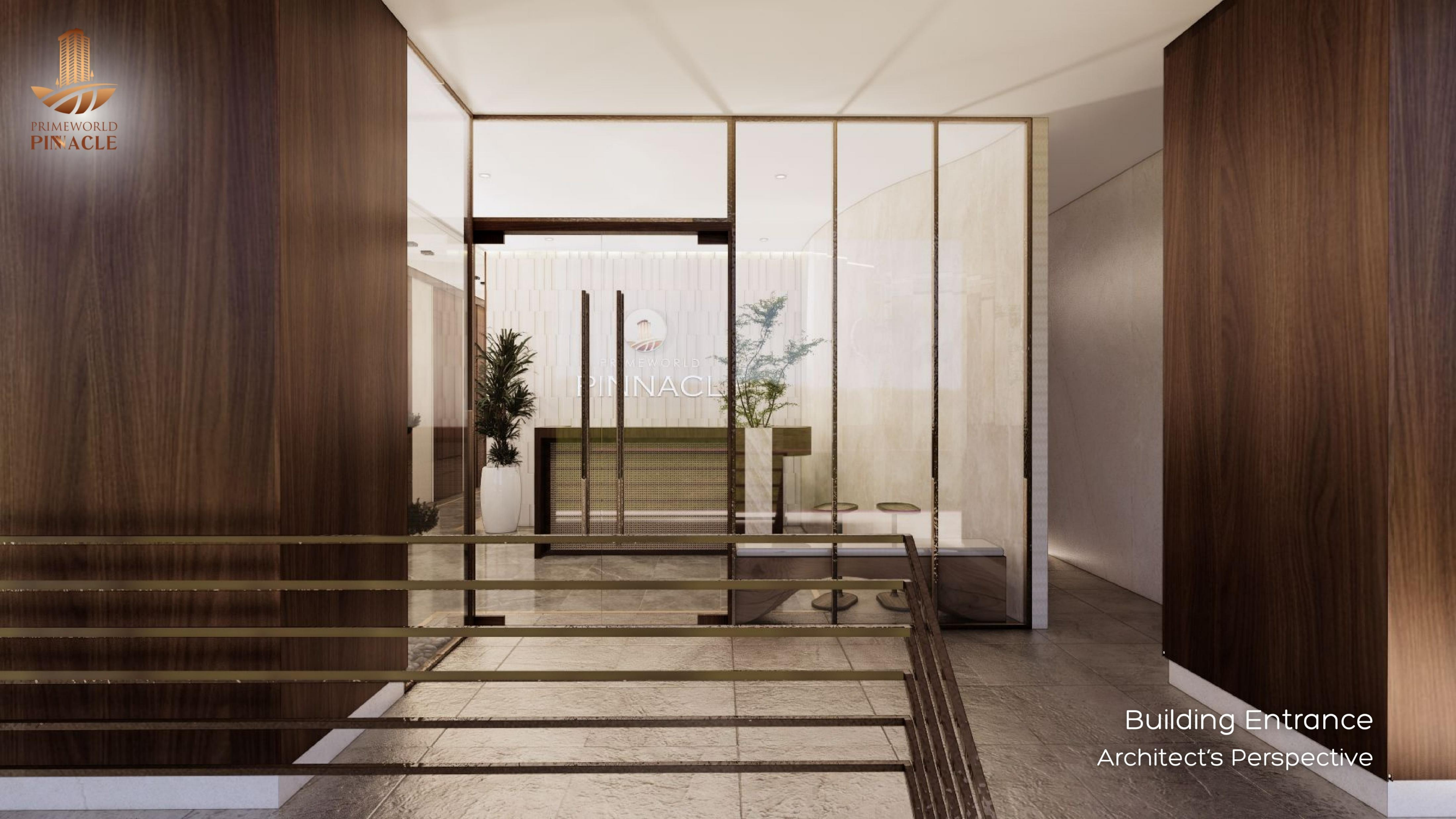
Building Entrance Architect's Perspective