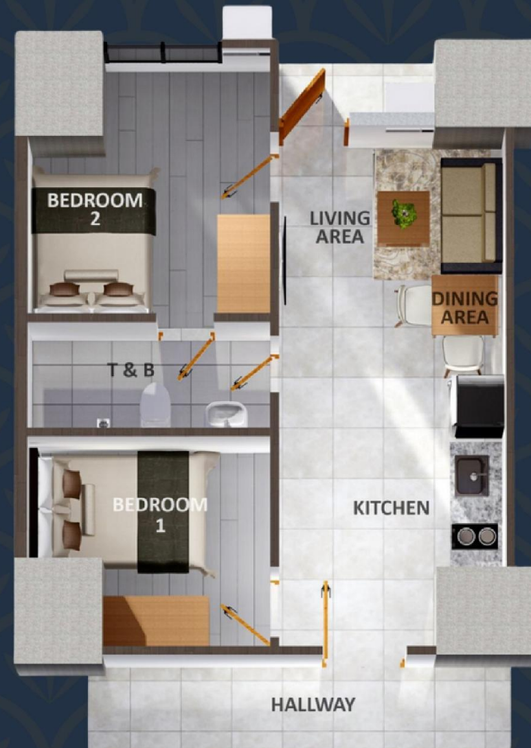
2 Bedrooms (35 sqm)