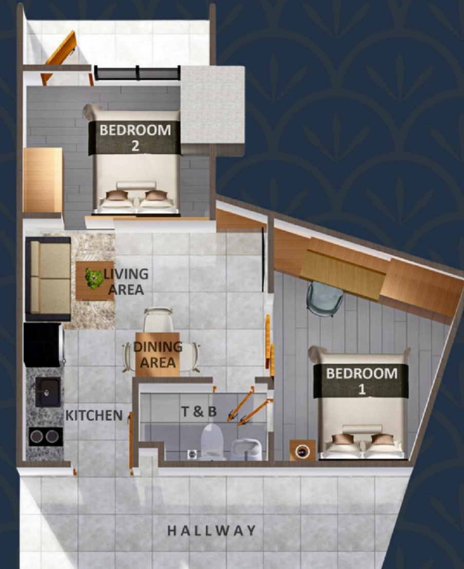
2 Bedrooms (34 sqm)