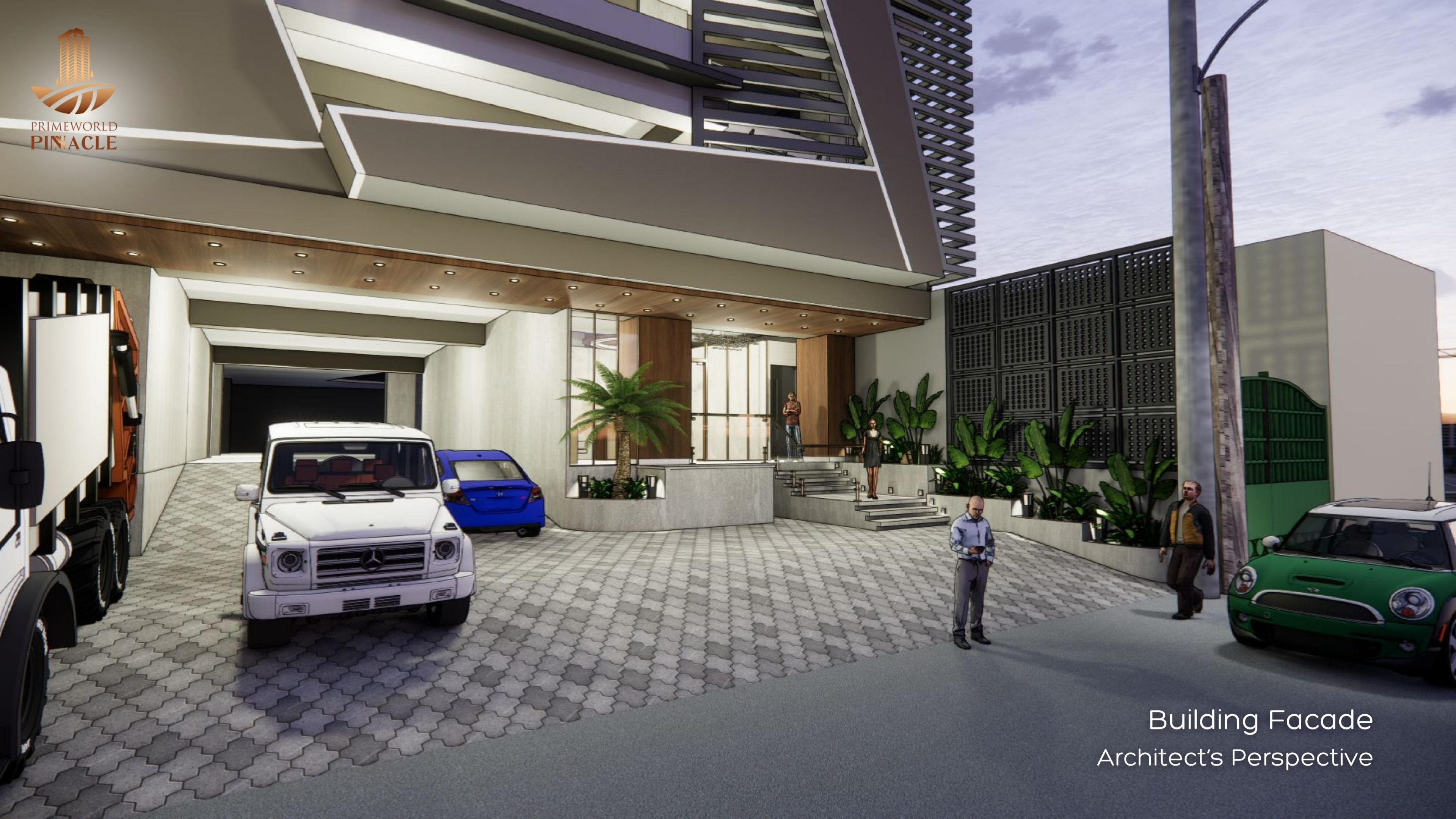
Building Facade Architect's Perspective